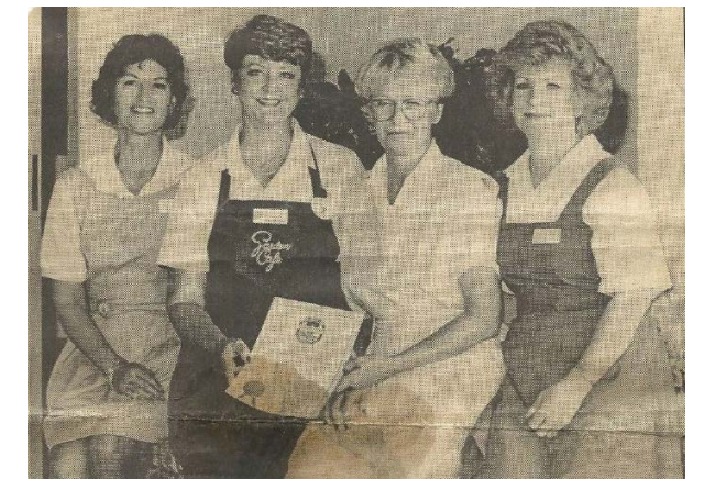
1993 San Mateo-Burlingame members model waitress uniforms from 1968-1973

SAN MATEO-BURLINGAME AUXILIARY ▶ The San Mateo-Burlingame Auxiliary hosted its first fundraising gala in 1947, a lavish affair in Hillsborough that was featured in LIFE magazine. Several years later, the Auxiliary opened the Garden Café, a restaurant and tea room. Members served as waitresses and models for the restaurant's fashion shows. The café remained a thriving enterprise for 47 years. The Auxiliary now sponsors a popular annual Game Day.